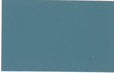
02 - SLATE BLUE