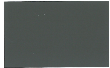
04 - CHARCOAL GREY