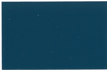
12 - HARBOR BLUE