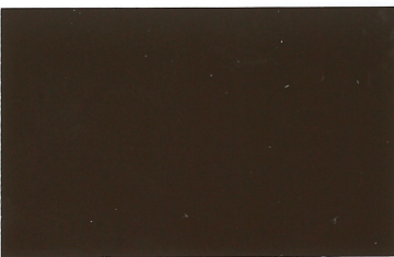
11 - CHOCOLATE BROWN