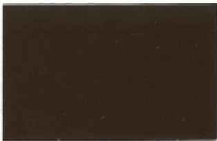
11 - CHOCOLATE BROWN